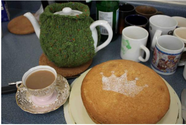
Tea & Cake to Celebrate the Coronation