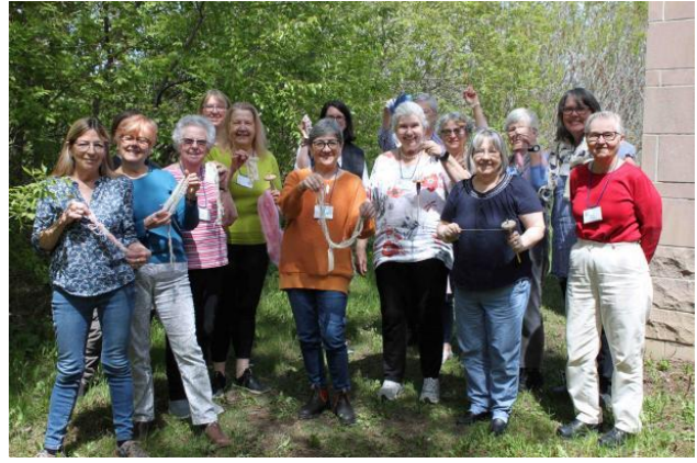
The Attendees - Ladies, where are your fascinators?