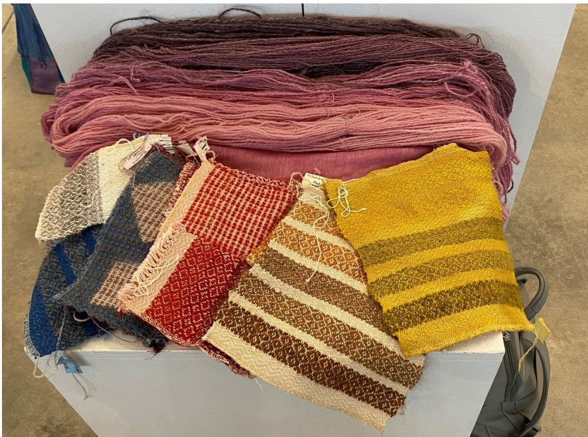
My work from the Penland Show & Tell