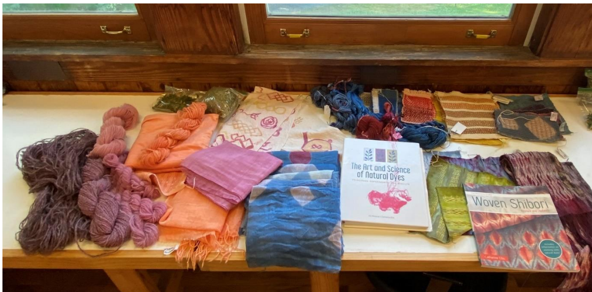
My Output from the Penland School of Craft

I still have some more updating to do with the samples we have, but hope to have it all done by September. Here's are a couple of pictures from the various dyeing techniques I learned at the Penland School of Craft.