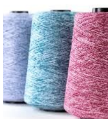
Yarns in Use